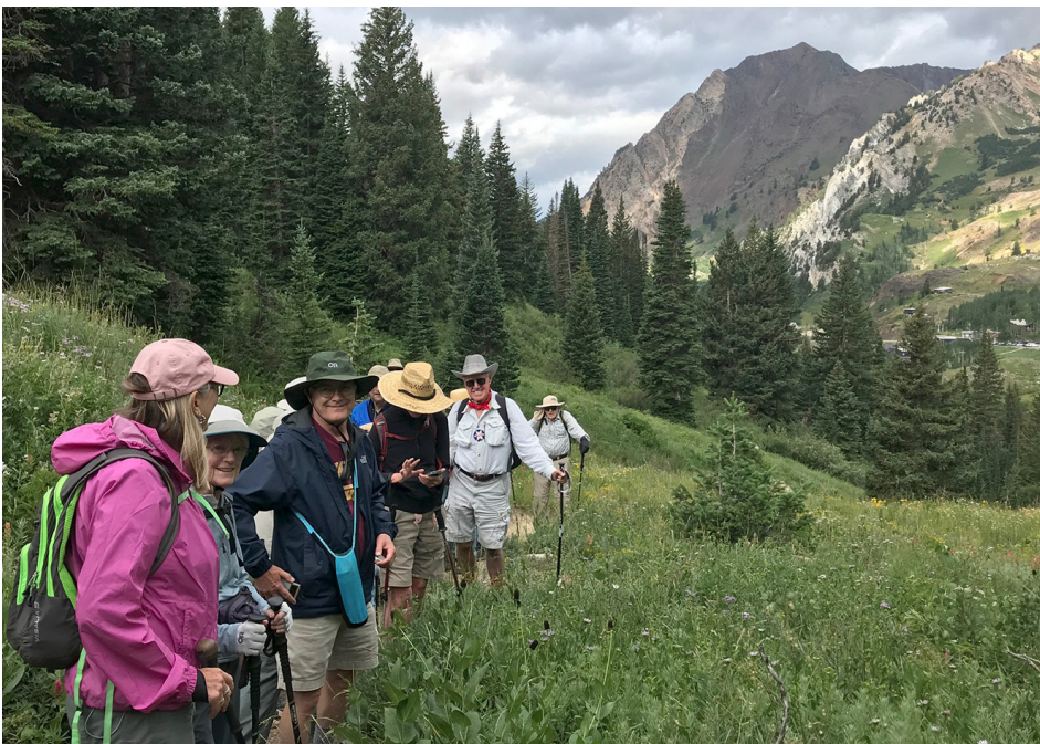
Big Cottonwood Canyon (Top)