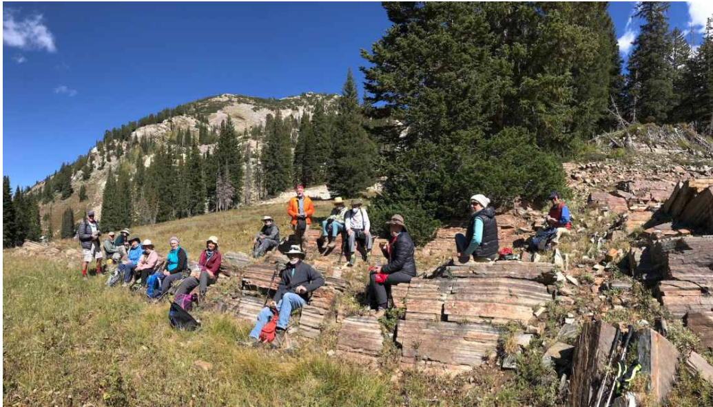
Alta geology hike this September

In April the Emeritus Hiking Group cautiously resumed hiking with those vaccinated. We moved our weekly hike to Monday, to avoid the increased local exploration of our mountains. Two out-of-town camping adventures were scheduled. In April we camped at the Big Bend Group Site along the Colorado River north of Moab to enjoy hiking, birding, a day raft trip, and great potluck dinners with half the group comfortable in Moab while those in tents fought the wind or luxuriated in our vans.