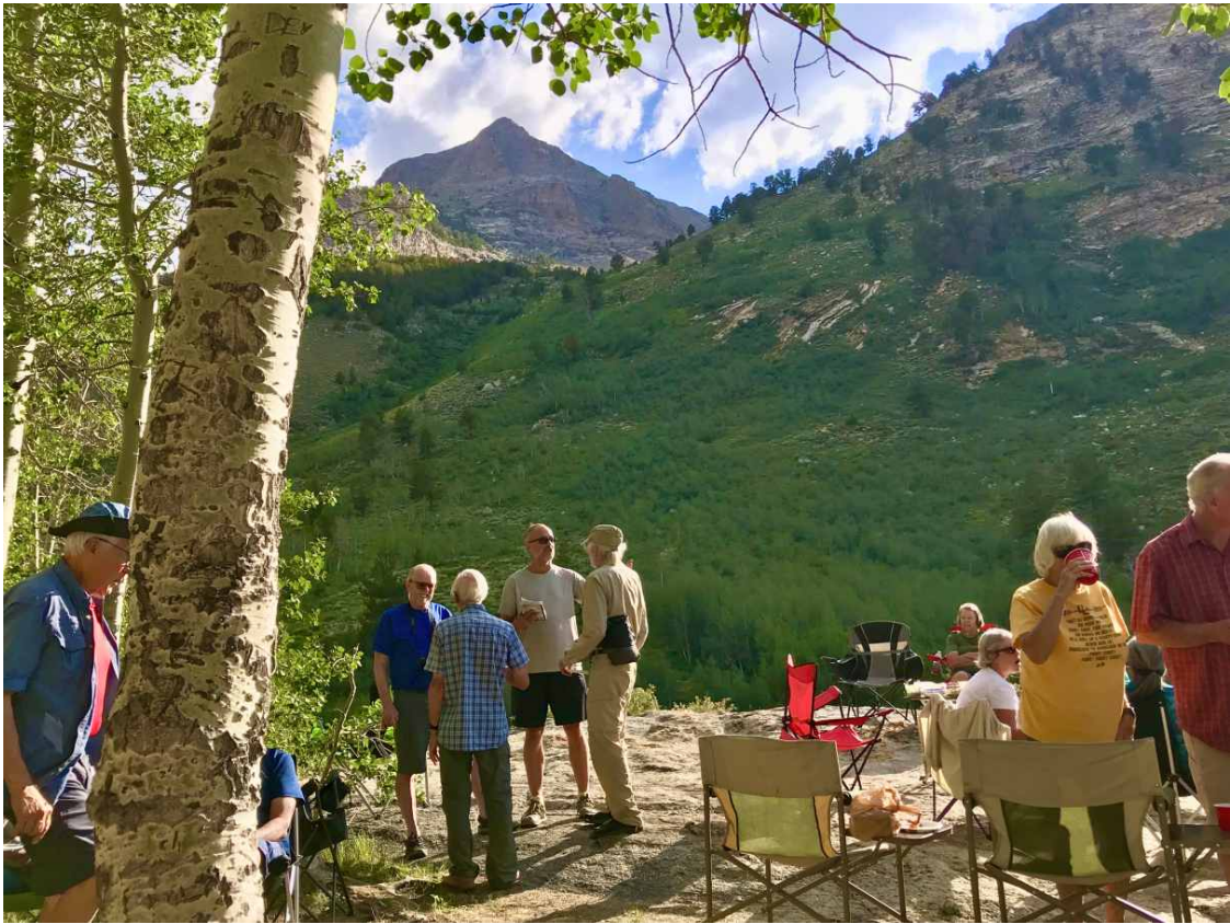
Ruby Terrace group campsite