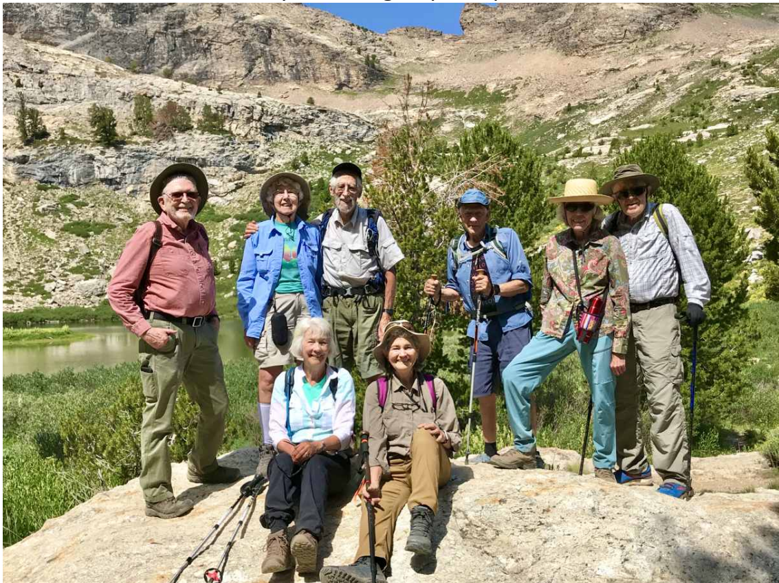
Lamoille Lake in Nevada's Ruby Mountains