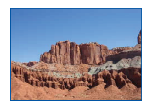
Along the scenic park drive